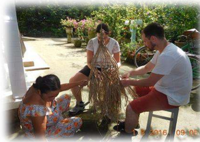
Making banana fiber hammocks